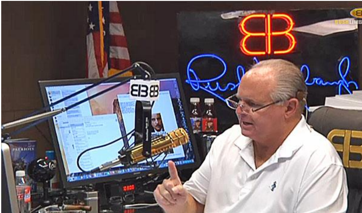
Radio host Rush Limbaugh